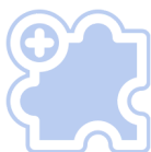
Exhibit Booth: $2,500

Showcase your business or organization through an engaging, memorable experience that draws attendees in and encourages meaningful interactions. Every attendee will have the opportunity to interact with you throughout the conference. The 2026 exhibitor area is located in an open space directly in front of the main ballrooms.