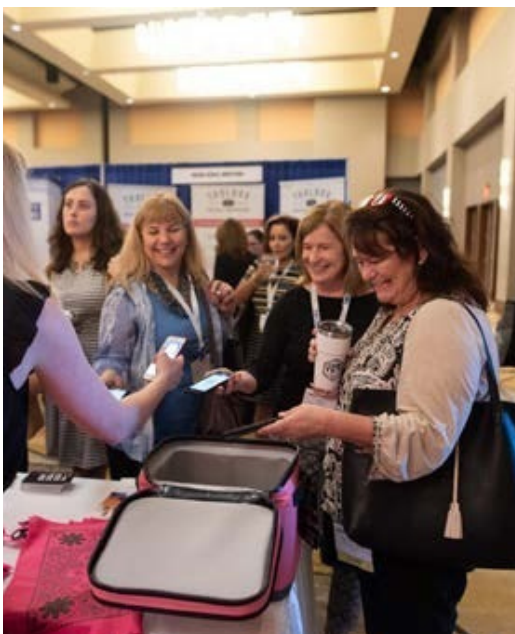
EXHIBIT HOURS: Thur, Sept 25 to Sat, Sept 27, 2025

Thursday: 6:00 pm to 7:00 pm ( During Welcome Reception )